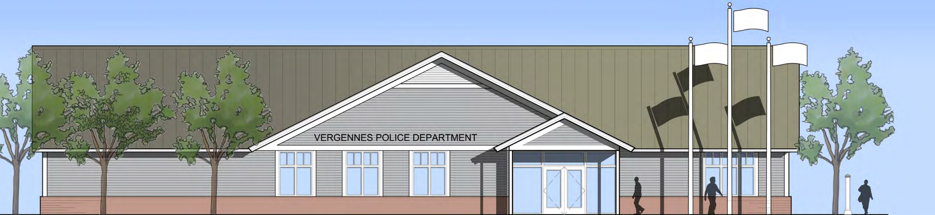
FRONT ELEVATION VERGENNES POLICE DEPARTMENT